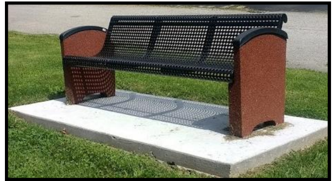
New bench installed at Old Meadow and Deerfield