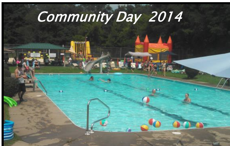
Community Day 2014