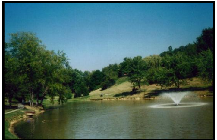
Pond Photo from the mid-90's