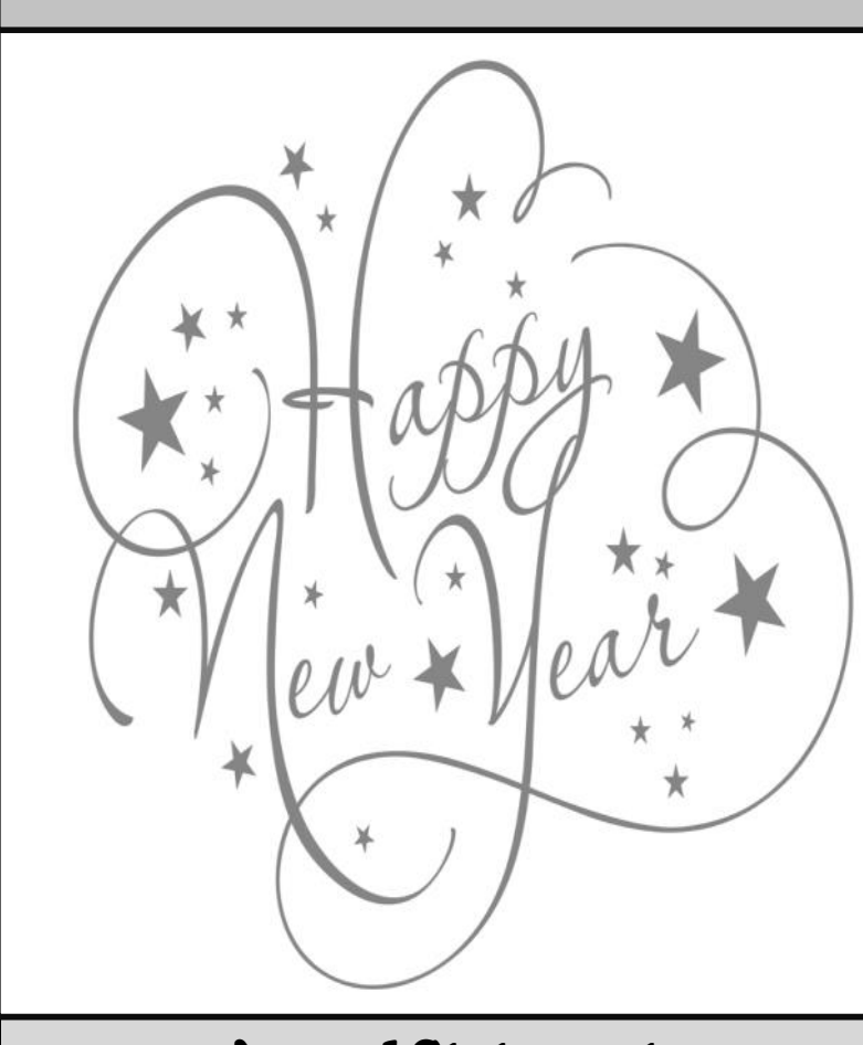
Annual Statements coming in the month