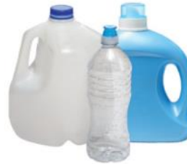
Plastic Bottles & Jugs