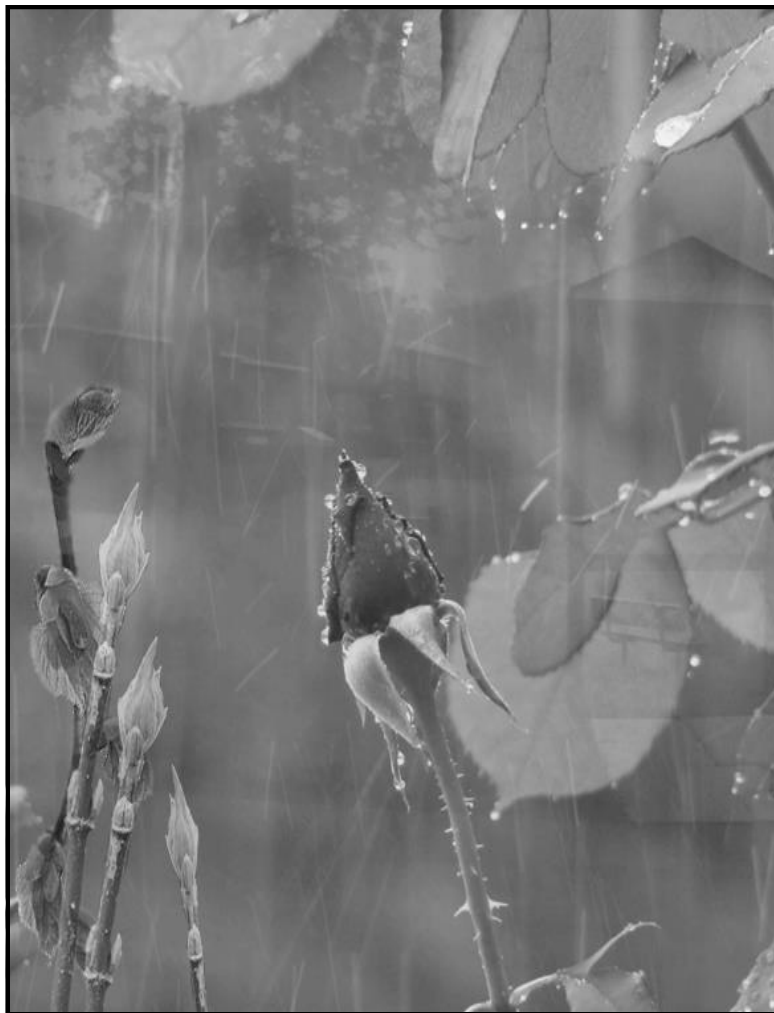
Easter Egg Hunt Photos (Page 10)